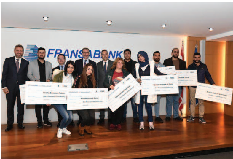
The ten winners in the donation ceremony

As for Fransabank's financial inclusion initiatives, by the end of December 2017, around 21,000 micro loans were recorded worth $ 41 million, 43% of the beneficiaries of these loans ranged between 18 and 35 years old, while the percentage of women beneficiaries was 41%. In 2018, and specifically in this initiative, Fransabank distributed 10 grants to five men and five women between the ages of 20 and 27.