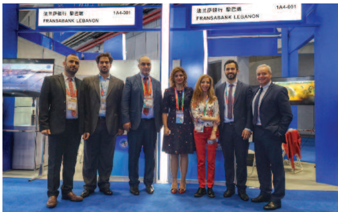
Lebanese delegation at CIIE

Fransabank Group participated in the first China International Import Expo (CIIE), which took place in Shanghai-China from the 5 to 10 November 2018.