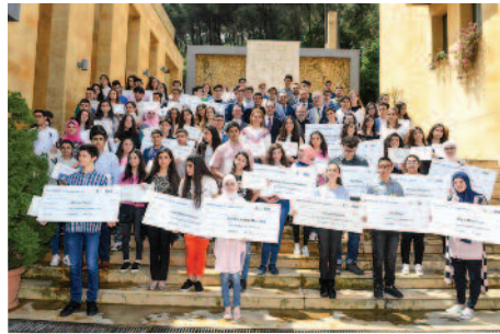
Group picture of the contestants and the winners