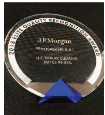
JP Morgan Award

The award further illustrates the Bank's leading presence in the global financial services market.