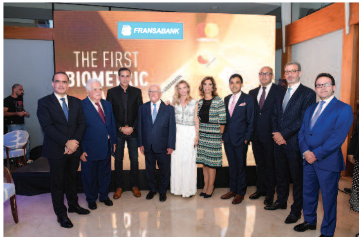
The launching ceremony

With more people indicating a preference for using biometric information to verify their identity, the roll out of this innovative technology reflects Fransabank's commitment to fulfilling customers' needs, and underlines the Bank's leading role in driving change throughout the global payments ecosystem.