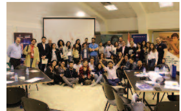
Injaz event in USJ

And as part of its commitment to supporting entrepreneurship and innovation for young people, Fransabank, in cooperation with INJAZ, held the "I Camp Business Challenge" on 17 March, 2018, at the USJ Campus, in which 18 to 21-year-old students were dispatched in 6 challenging teams. The workshop aimed at helping students gain insight into the complexities and rewards of entrepreneurship and business in today's interdependent