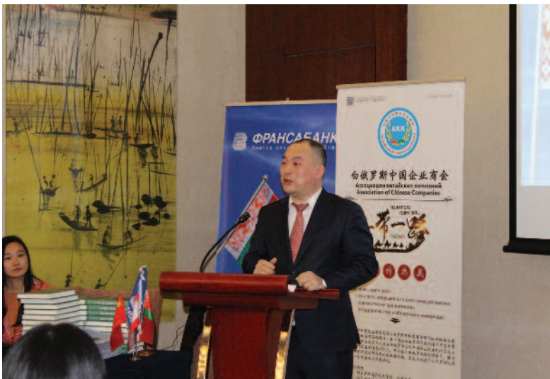
Chairman of Association of Chinese Companies in Belarus speaking at Fransabank Group Seminar in Belarus