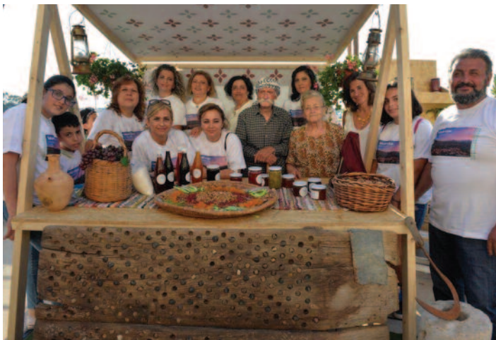
One of the stands of the competing villages

Aiming at highlighting the charming rural areas of Lebanon, and promoting rural tourism, Fransabank partnered with the Ministry of Tourism in Lebanon and L'Orient le Jour (OLJ) newspaper, to launch a corporate social responsibility initiative, focusing primarily on encouraging tourists, expatriates and residents to go outside the city and discover the natural, cultural, religious, archaeological and gastronomic sides of Lebanon.