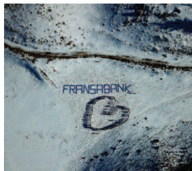
a heart-shape formed by Fransabank employees in Chouf Cedar reserve

In a fast-paced working and extremely productive environment, Fransabank Human Resources Department is always committed to its own "human-centered" philosophy thus creates cheerful and casual occasions which gather all Fransabank's people outside the working context. These occasions include bonding activities objectives which are to enrich teamwork spirit, drive responsibility and creative thinking.